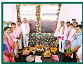
Sangameshwara- Basaveshwara Lifer Irrigation Projects