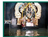
Jala Narasimha Swamy Temple